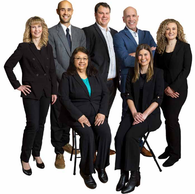
Lake Elmo Bank Mortgage Department